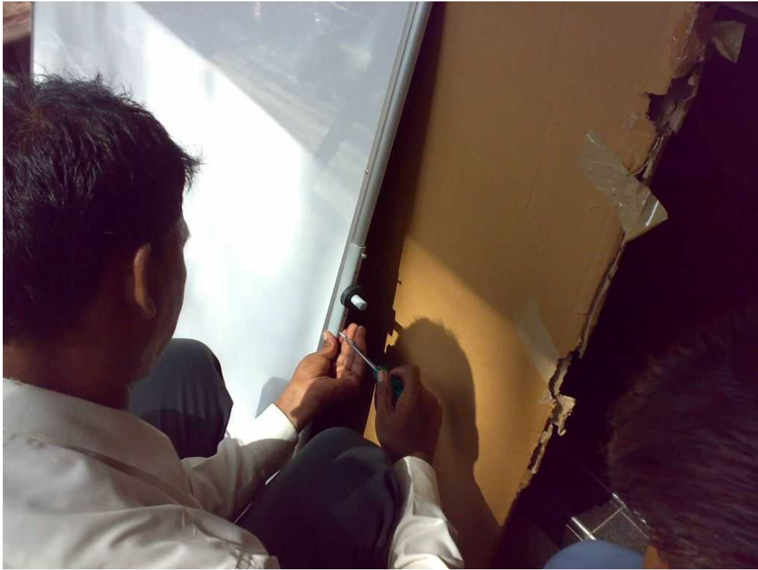
Fitting of bracket on the other side of the board.