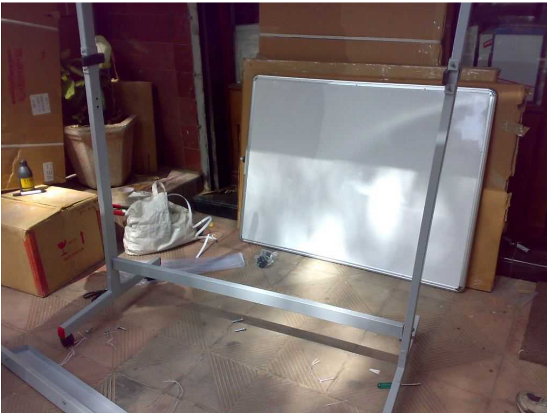
After Fitting the Base Bar on the two Side Posts (Keep the assembly slightly loose)