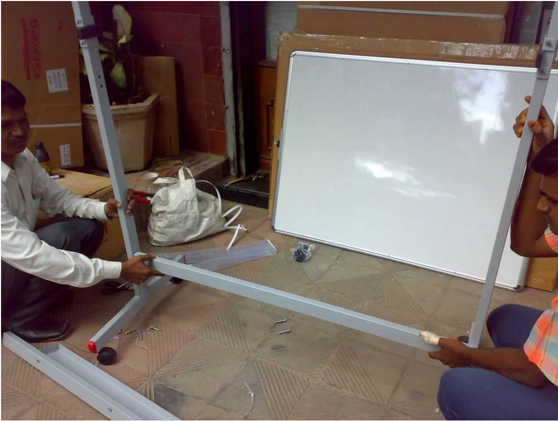
Fix the Base Bar on the 2 Side posts