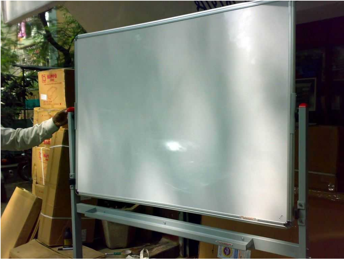
Board fitted in the knobs