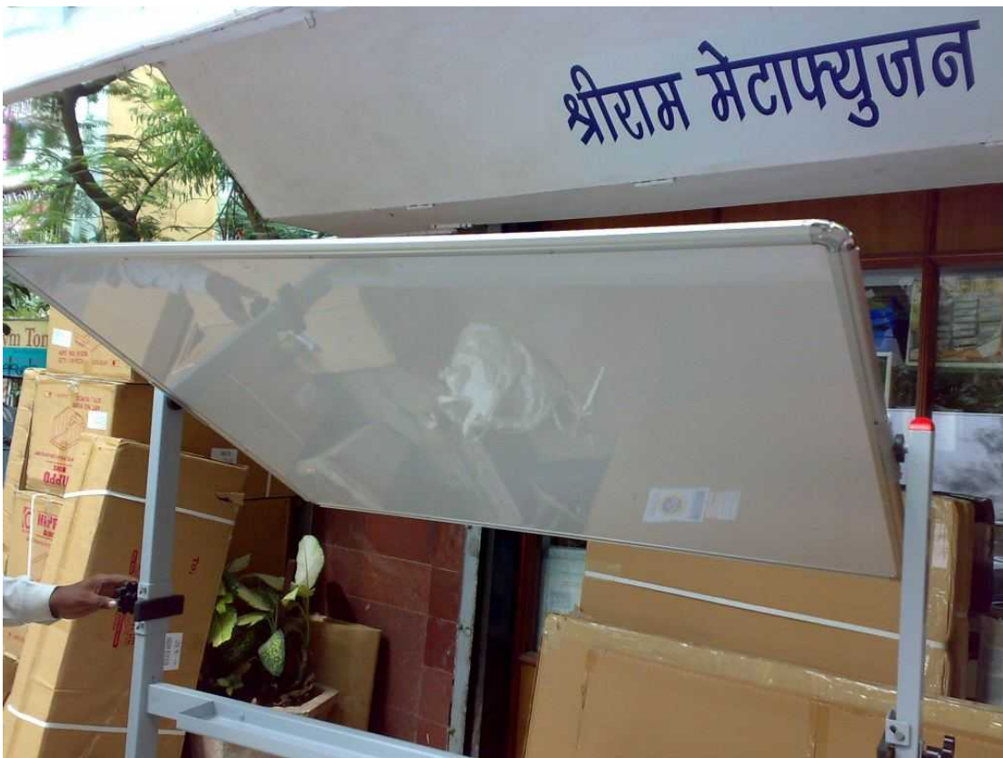
Board can be rotated for use on both sides