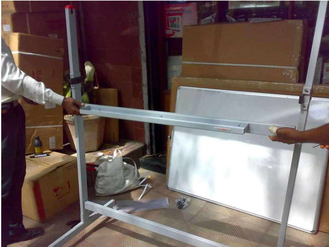
Fix the Center Bar with the Pen & Duster holder. The stand is ready for the board.