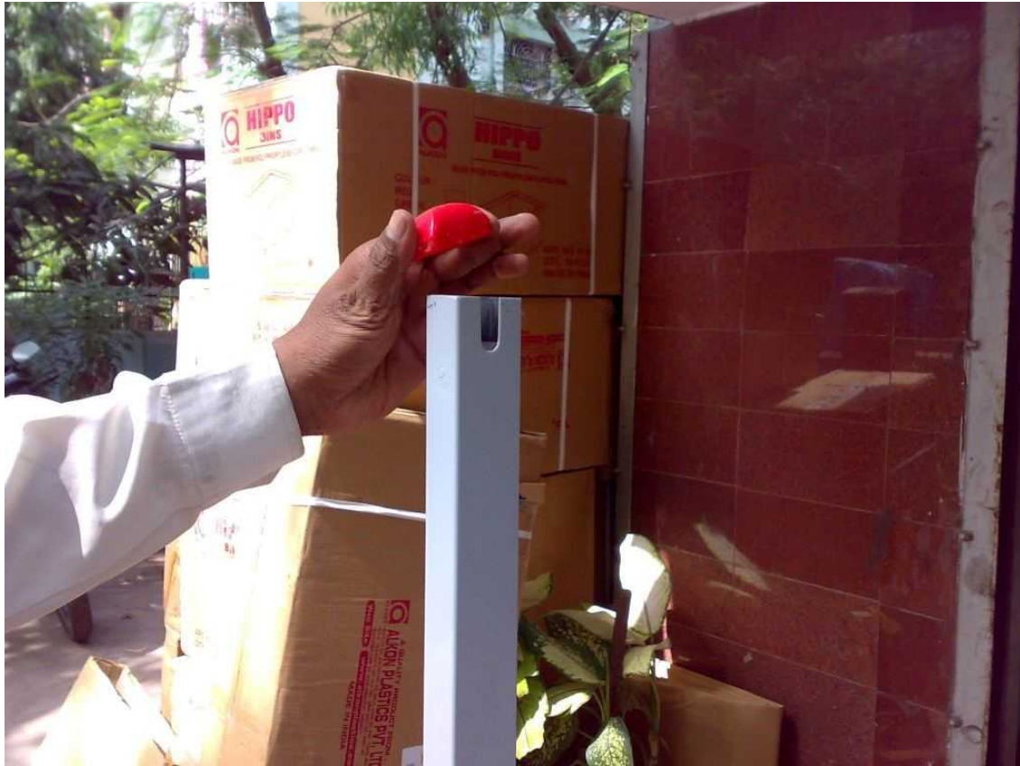
Remove the red Plastic Knobs