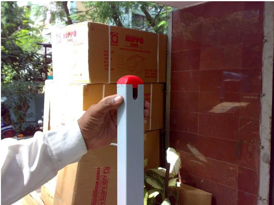
The Red plastic knob on top is to be removed to fit the board.