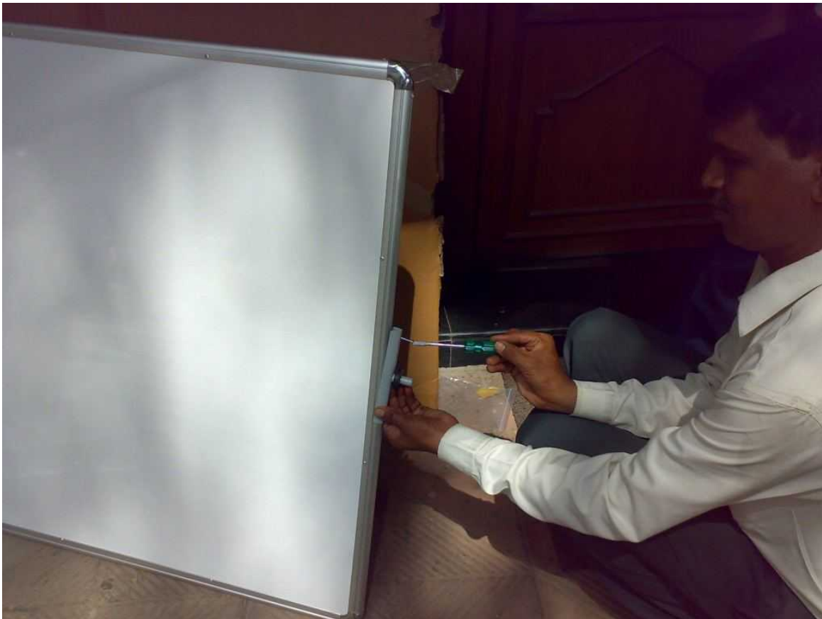
Fix the Side Brackets on both sides of board. The holes are predrilled for the bracket Page_2