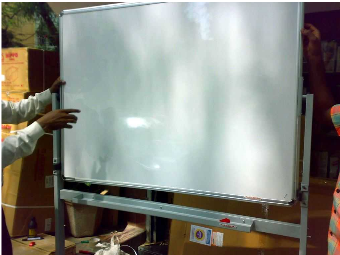
Fix the board in the slots provided Page_4